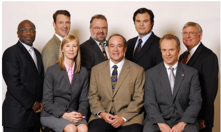
Arizona School Choice Trust Board Members