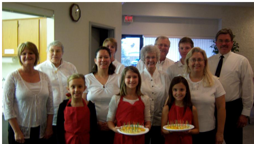
Wait Staff: Left to right back to front