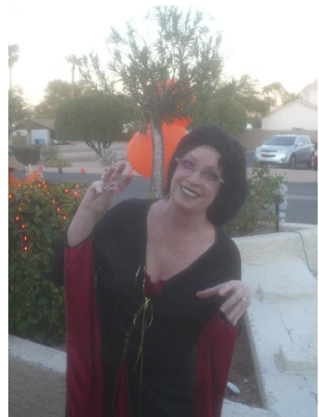
Guess Who? See back page